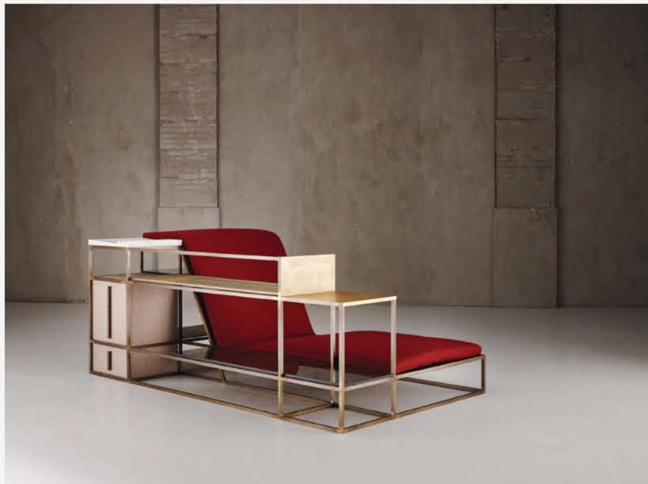
Living in a Chair proffers a luxurious reading unit