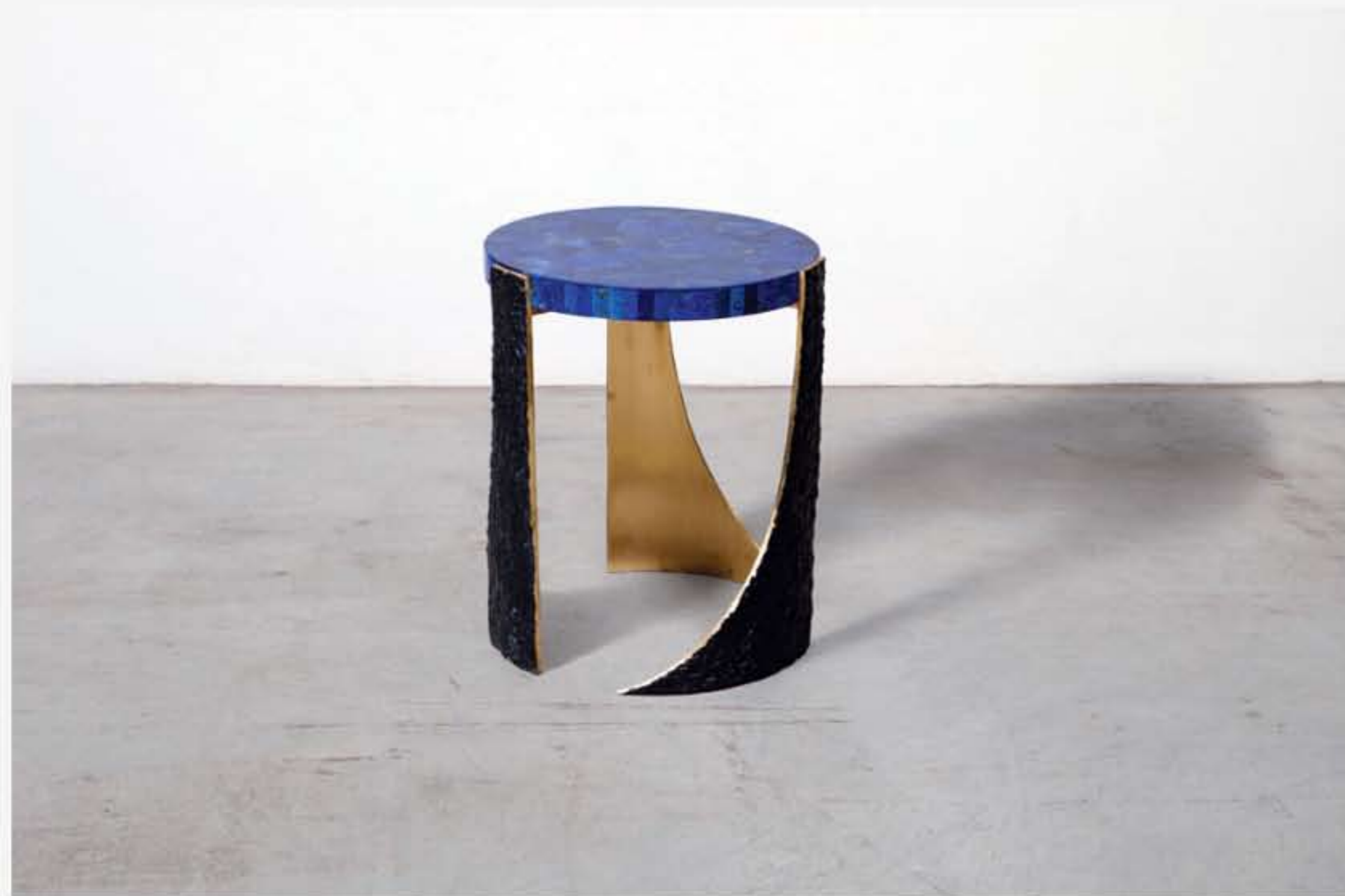
The Lapiz collection beholds wonders in lapis lazuli

With an enviable career history including a position at the Metropolitan Museum of Art in New York City, Lebanese artisan Hicham Ghandour's offerings were also well received at this year's iSaloni . Selected from his Lapiz collection, Ghandour's Low table for Nilufar was as much an artwork as it was a small table. Low is a beautiful bronze and brass combination whose structure Ghandour topped with a white marble surface that had been covered with lapis lazuli from India, giving it an arresting azure colouring.