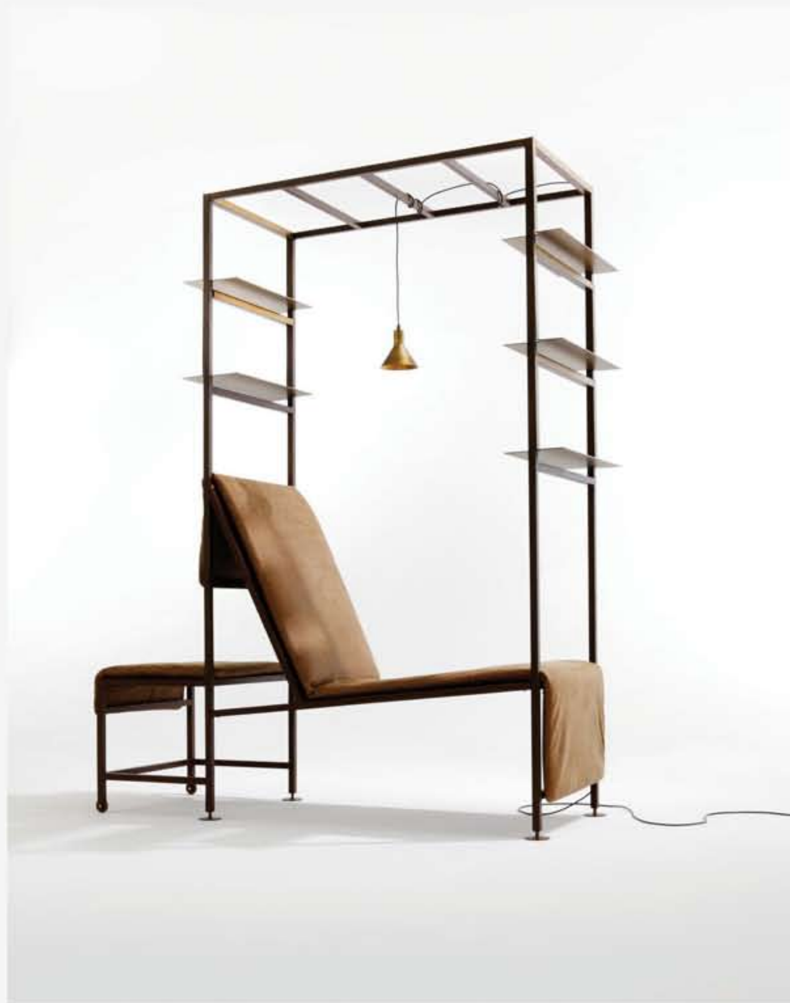
Shelves, reading light and two chairs – what more could one ask of the Biblioteca Itinerante?

The reading unit Living in a Chair drips in opulence with its Arabescato marble and bronzed-glass surfaces that top the lightly burnished brass shelves. Peri fashioned the cabinet compartment out of wood to hold any reading materials, and the gorgeous chaise he upholstered in a berry-hued felt, emanating the gild of The Great Gatsby .